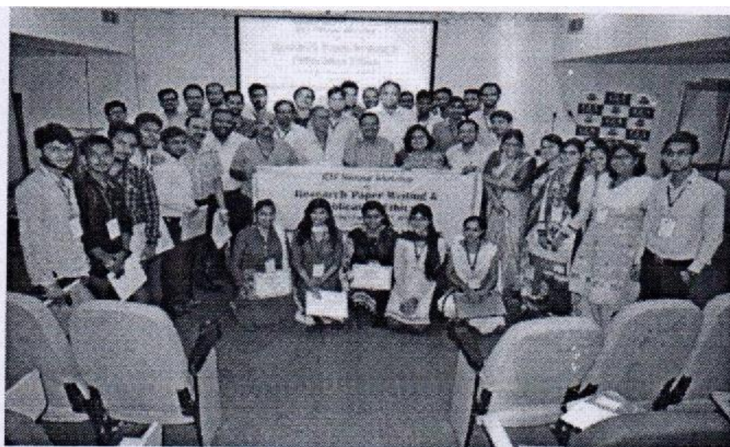
Young Professionals Group Photo Session at the end of the Event.